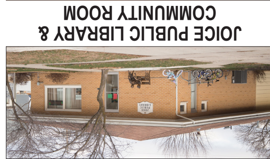
JOICE PUBLIC LIBRARY & COMMUNITY ROOM