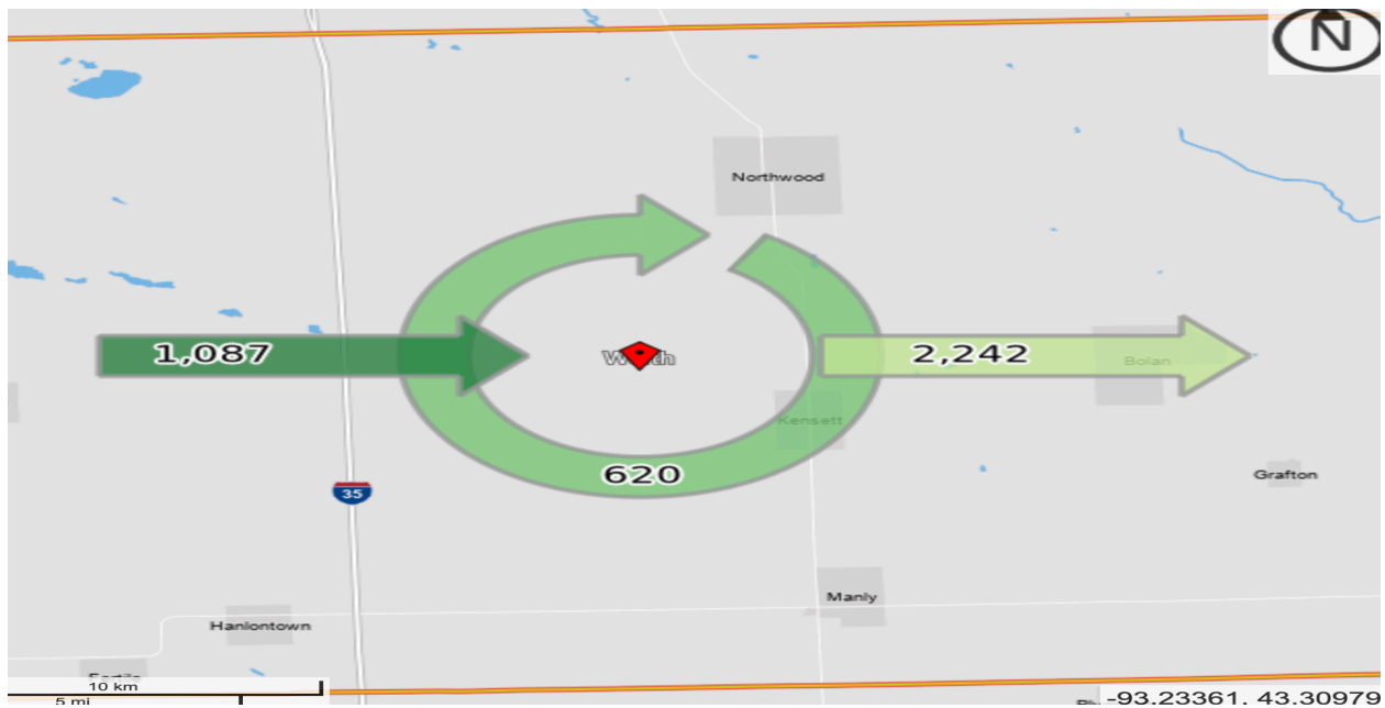
Figure 1: Worth County Workforce Commuting Pattern